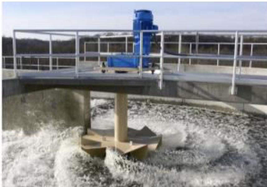
Fig: 3. Aeration

(i) Aeration- Aeration involves bringing air or other gases in touch with water to Convert volatile substances from liquid to gaseous state and Dissolves.